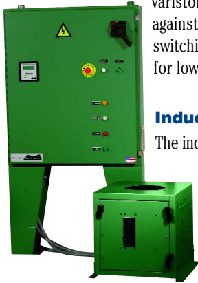
The induction side-seam pre-cure system uses solid-state switching components to provide energy efficient, safe, even heating.

The control board auto-tunes to the optimal frequency between 5 KHz and 15 KHz, for best performance. MOVs (metal oxide varistors) and snubber circuits provide protection against electrical spikes. Zero-voltage power switching and pulse-by-pulse current monitoring for low EMI and RFI provide reliable operation.