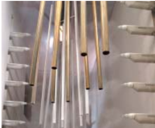
Teknicote may coat hundreds of thousands of parts in a week, running 10,000 pieces per hour or 100 pieces per hour on the same line, depending on the size of the part and the job. Coated materials include steel, zinc, aluminum and brass.

Barthelemy adds that downtime could be further reduced if line speed were consistent, but with the variety of parts coated and the vast differences in sizes, the line may run at 8