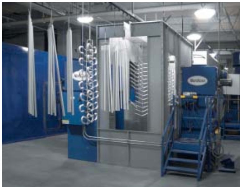
“It doesn’t matter if it’s a small batch or a trailer load, we now have the flexibility and capacity to coat a tremendous variety of parts with the consistent quality and fast turnaround our customers demand,” Teknicote says.

Quick color changes are made possible through a number of features, including dual cyclones with