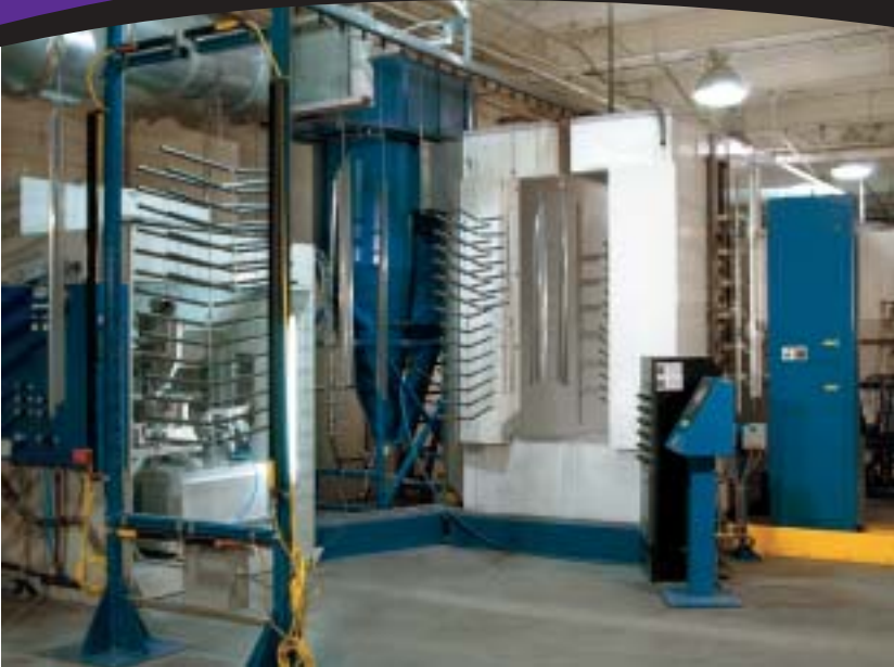
Teknicote now achieves system efficiencies above 95%.

hinged sections that open for easy inspection and cleaning, and the absence of conventional ductwork between the booth and cyclones.