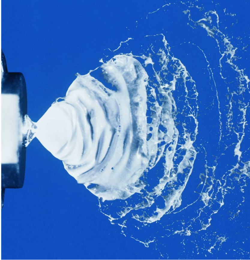
Airless atomization begins with a fluid film that becomes unstable as it meets air resistance. Stop action (above) shows progressive disintegration into ligaments (connecting strands) and then into droplets.