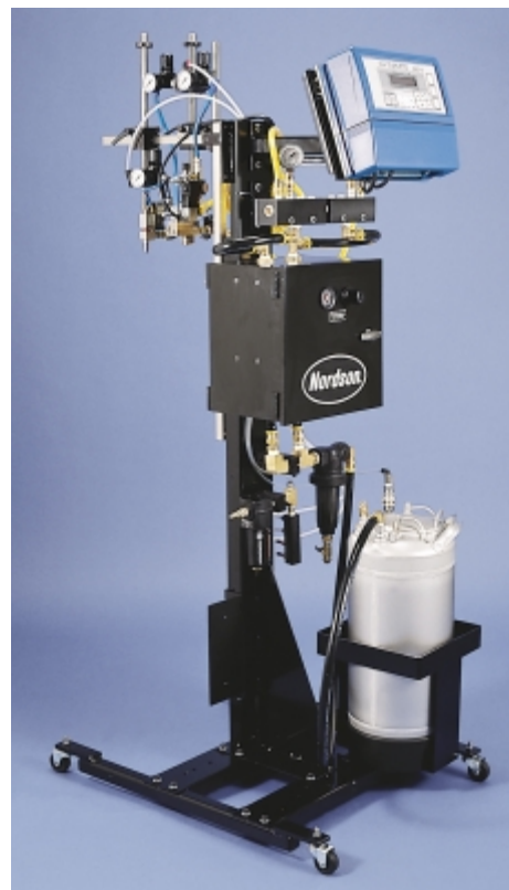
Cold Adhesive Pallet Stabilization System

Cold adhesive bead and spray guns provide integrated adjustment for accurate adhesive volume control.