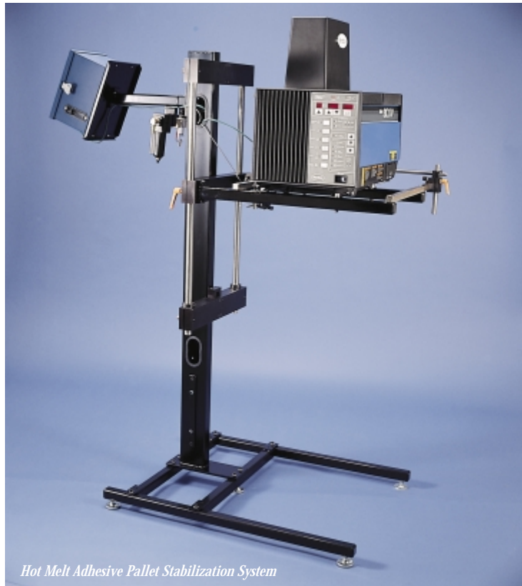
Hot Melt Adhesive Pallet Stabilization System

Versatile systems offer the right system solution for your production.