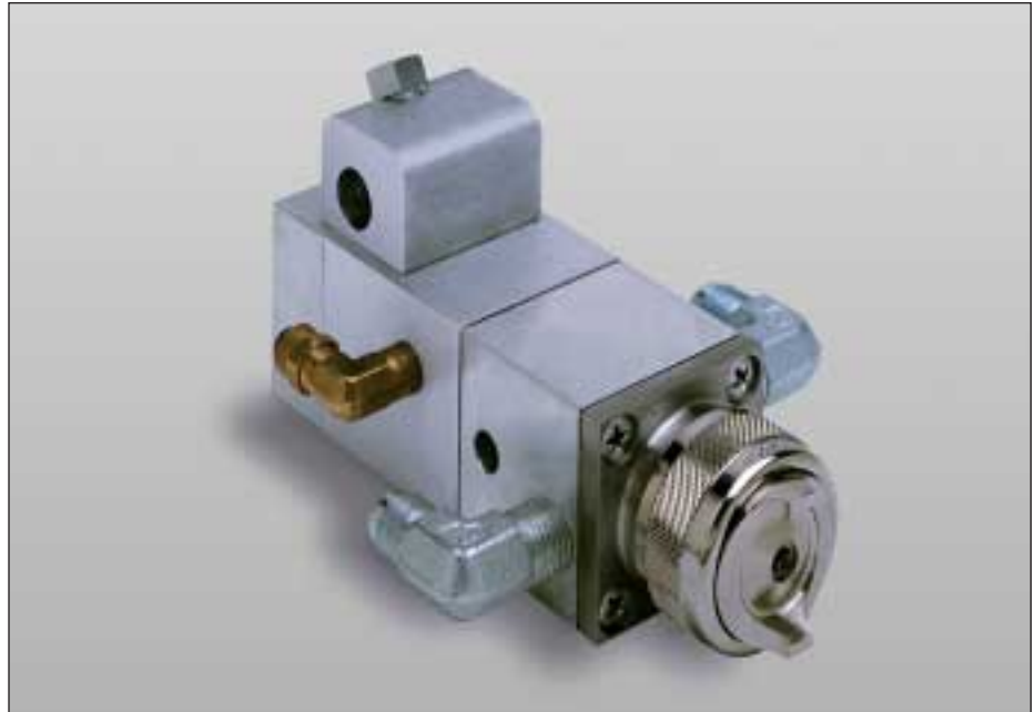
Stainless steel model of the A7AA gun

The A7AA gun provides high-speed triggering capability without spitting and dripping. Fast on/off response time allows for high-speed cycling in "stitching" operations and exceptional needle and seat life in abrasive applications. In very high-speed stitching applications, the air-assist feature can be adjusted for a continuous air bleed to minimize the spitting problems associated with spray guns when subjected to high-cycle applications.