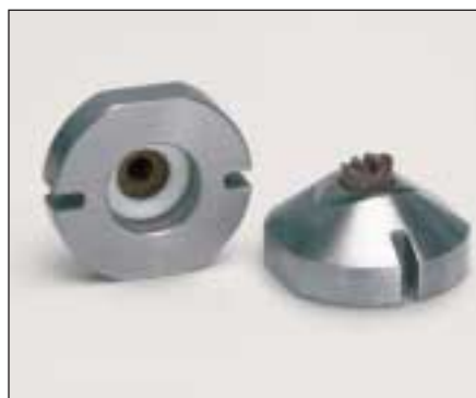
Nordson Cross-Cut nozzles

The Model A7AA gun uses patented Nordson Cross-Cut® nozzles which provide improved atomization with a wide range of materials including highly viscous and difficult-to-atomize coatings. At a given fluid pressure, Cross-Cut nozzles produce greater atomizing energy compared to conventional airless spray nozzles. The result is a softer, low-velocity spray which helps minimize dripping, material waste and equipment wear for a cleaner, more efficient operation.